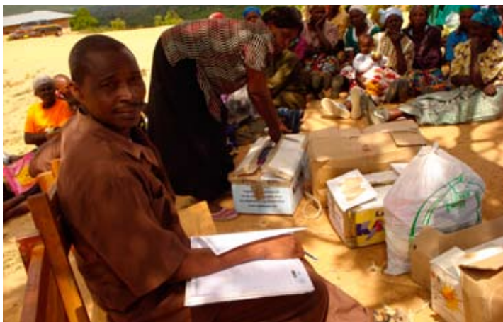
Headmaster of Kiukuni Primary School during a prize giving