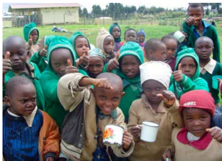
Sulmac Kids after a meal

In total we are sponsoring 1,005 pupils in these three schools.