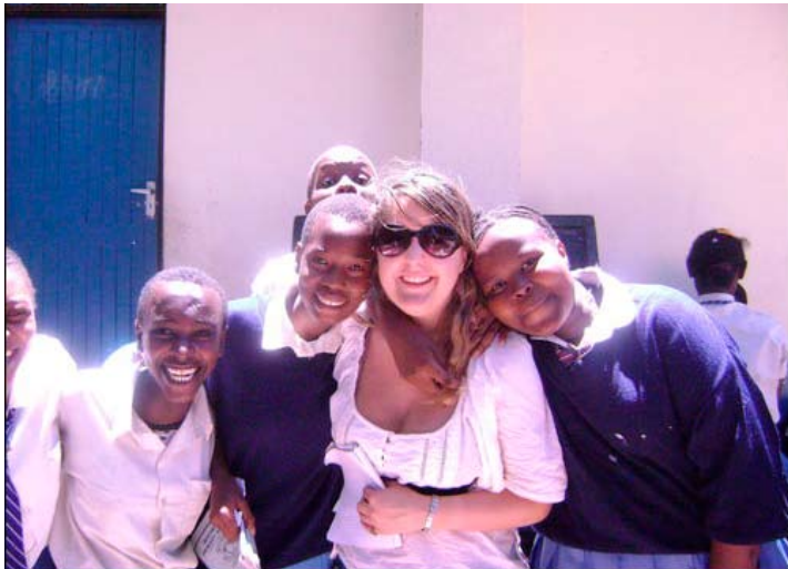
One of the volunteers in teaching