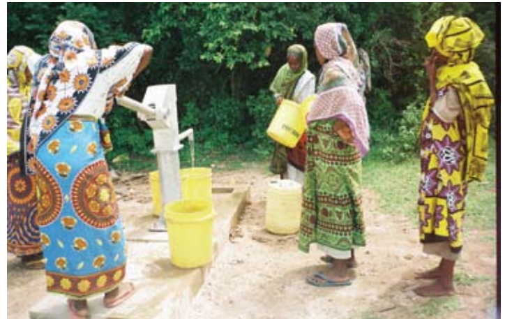
Mkwiro Women at the borehole

Mkwiro water, which is awaiting treatment plant, is the main priority since its half way complete. Efforts are being made to acquire the treatment and desalination plant which is very costly but will have sorted out the water problem in a long while. MCBO has approached Electric aid company in Ireland to fund for this plant and is still trying to source for funds to complete the project.